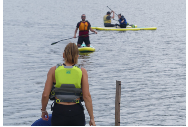
Athletes preparing for the race portion of the Just Paddle It! Festival race.

The Just Paddle It! festival began in 2019 as an opportunity for athletes and communities to come together for friendly competition. Due to COVID-19, there hasn't been another festival since the Summer of 2019. The 2021 JustPaddleIt! Festival became significantly more exciting as restrictions eased and allowed for an event of this magnitude to finally commence.