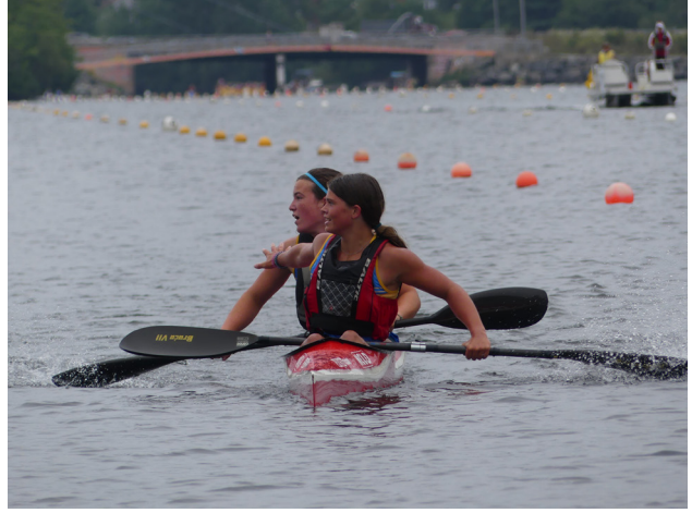
Pisiquid athlete reaches back to celebrate with their teammate at the end of their K2 race at the U12/U14 Championship

The U12/U14 Championship is the largest competetion for U12 and U14 athletes in the world with three full days of racing and nearly 1000 athletes competing on one of the best natural race courses in Canada.