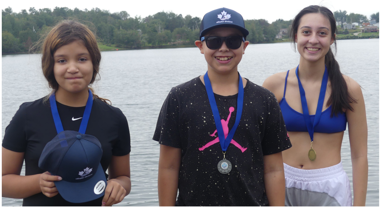
Top three youth athletes after the race portion of the JustPaddlelt! Festival 1000m youth race in Eskasoni, CB.